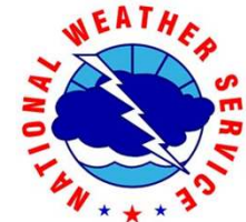
National Weather Service