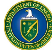
US Department of Energy