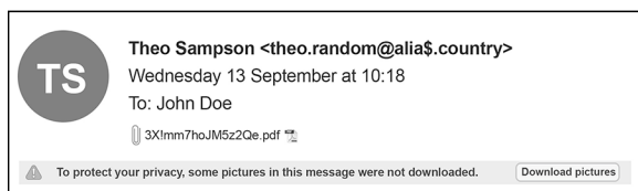
FIGURE 2-2: An example warning message when image is included.

To prevent sharing information about your device and location, make sure to disable automatic image downloads in your email client. That way you control when to download images from incoming email.